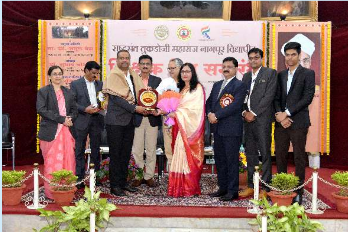
Ambe Durga Education society was awarded with the "IDEAL EDUCATION SOCIETY" award by RTMNU.